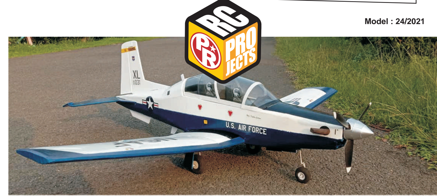
Model : 24/2021