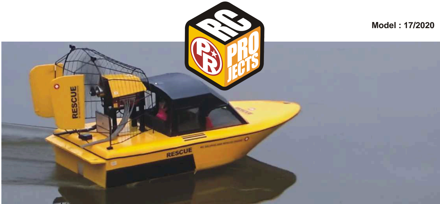
Model : 17/2020